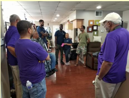
Alpha Omega: The Talk

In collaboration with MedStar Health and M&S Barbershop in NE Washington DC, the Brothers of Alpha Omega Chapter engaged men in the community raising awareness about the importance of fatherhood. During the Barbershop Tour, they spoke with and distributed useful information and resources designed to help men become better fathers.