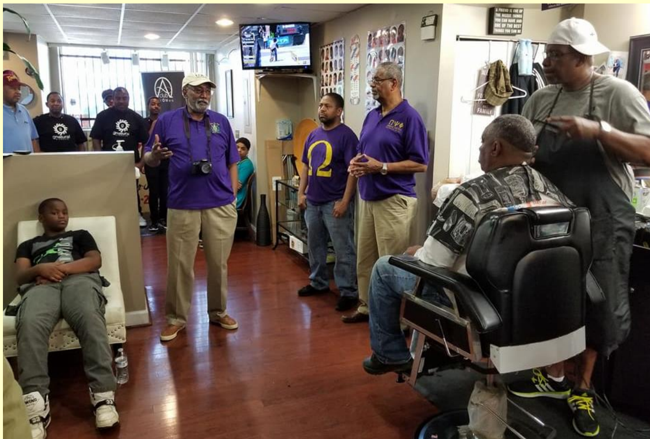
ALL ABOUT HEALTHCARE: THE “BARBER SHOP” TALK

NE Washington, DC –In collaboration with MedStar Health and M&S Barbershop in NE Washington DC, the Brothers of Alpha Omega Chapter engaged men in the community raising awareness about the importance of fatherhood; they distributed useful information and resources designed to help men become better fathers.