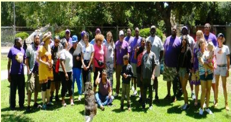
Fathers, Families and Friends of Zeta Tau Chapter