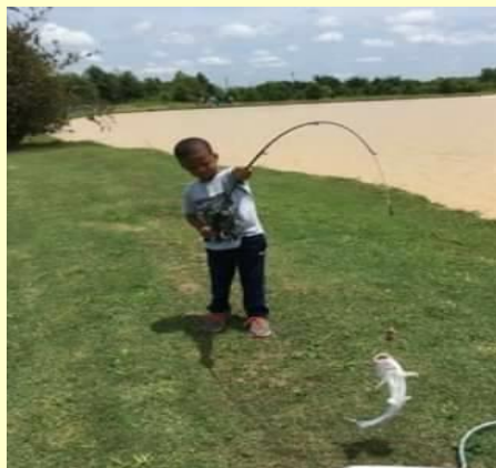
Hold that line “Lil brother!”