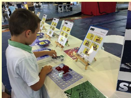
Elementary student assembling project number 6 for a Laser Gun. It demonstrates how integrated circuits can be changed to exciting space war sounds.

DoDEA South Pacific District Science and Robotic Fair held on April 28, 2017 at the Foster Field House and Community Center on Camp Foster Marine Corps Base in Okinawa, Japan.