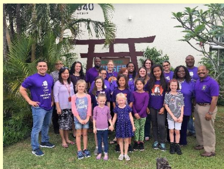
“Purple Up! For Military Kids!”

During the month of April, Department of Defense Education and Activity (DoDEA) schools around the world plan special events to highlight programs and services provided for military connected students.